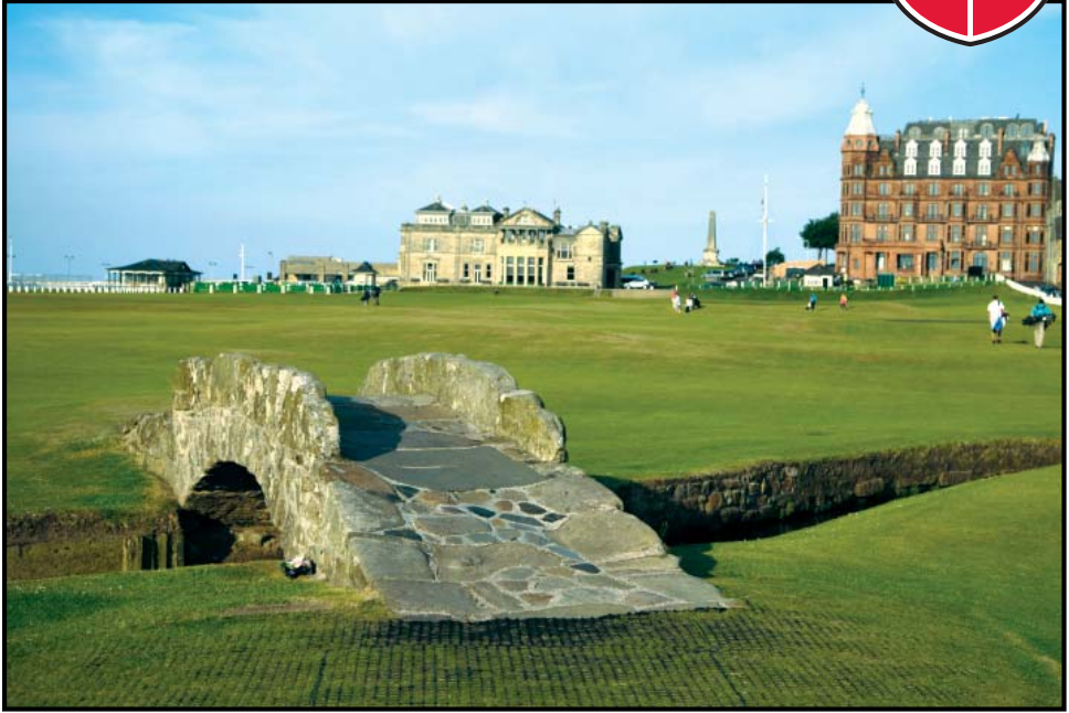
Old Course at St. Andrews, Fife, Scotland