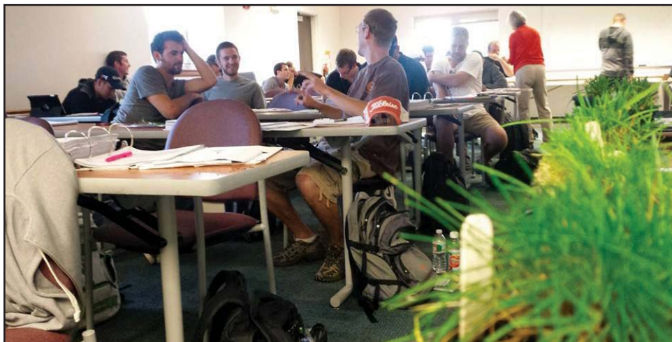
Turf students in class at Rutgers University, Ralph Geiger Turfgrass Education Center